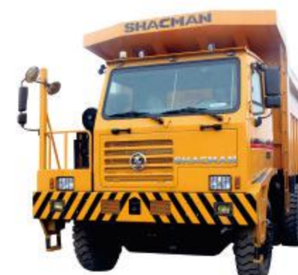
Off-road dump truck