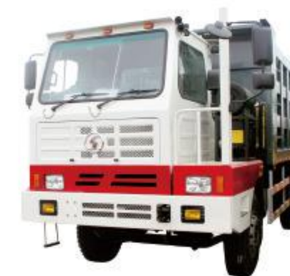
Offset dump truck